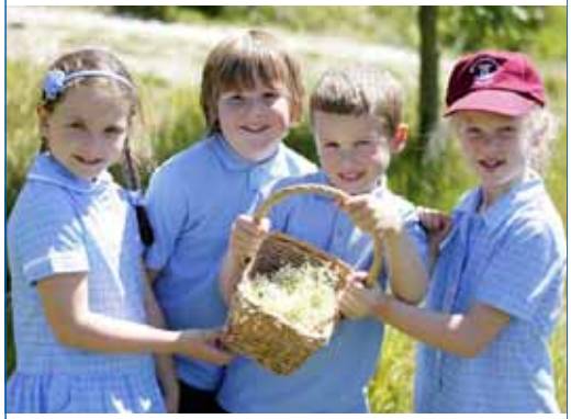
Come along and discover how we can make a difference for your child...

Nursery & Junior School Open Day Friday 25th May 2012, 10am to 12pm