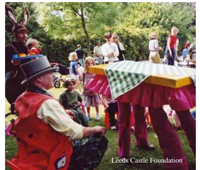
Leeds Castle Foundation

Lookout for the Caterpillar sitting on his shiny red mushroom although you will most likely hear him first, he does like to attract attention! Say hello to Tweedle Dum and Tweedle Dee , who will be wandering around being infuriating, ridiculous and