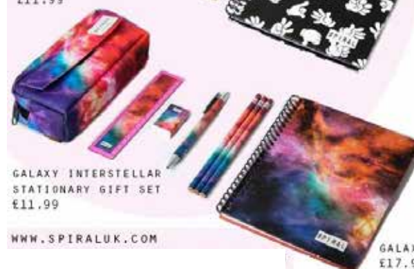
GALAXY INTERSTELLAR STATIONERY GIFT SET £11.99