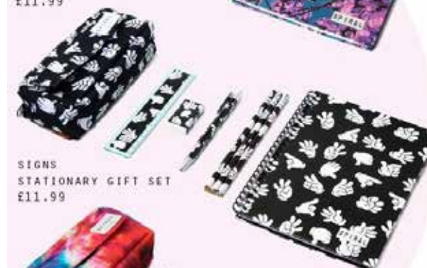
SIGNS STATIONERY GIFT SET £11.99