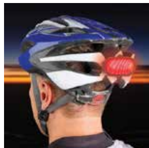
Whitby & Co.

Nite Ize Helmet Marker Plus Stockists: Whitby & Co. SRP: £10.95 The Helmet Marker Plus makes you stand out in the dark and rough weather. Strong velcro provides secure attachment to the back of your helmet and it's bright red LED provides instant visibility. Features a passive reflective pattern for added safety. Features: •Bright red LED illumination - Glow or Flash modes •Passive high visibility reflective pattern •Features strong velcro to attach to nearly any helmet •Features Gear Ties for additional attachment options