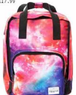
GALAXY INTERSTELLAR LITTLE ASHBURY £17.99