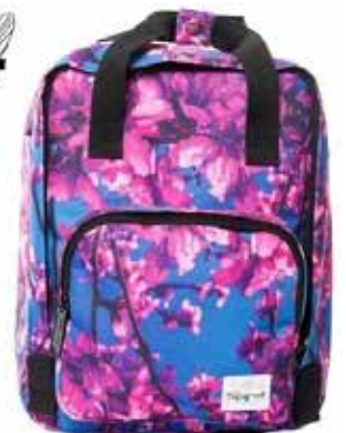
SUMMER BLOSSOM LITTLE ASHBURY £17.99