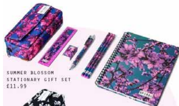
SUMMER BLOSSOM STATIONERY GIFT SET £11.99

WITH THE LATEST COLLECTION OF BRIGHT, BOLD AND FUN BACKPACKS AND STATIONERY SETS FROM SPIRAL, YOU'LL BE THE MOST FASHIONABLE KID IN CLASS.