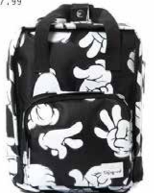
SIGNS LITTLE ASHBURY £17.99