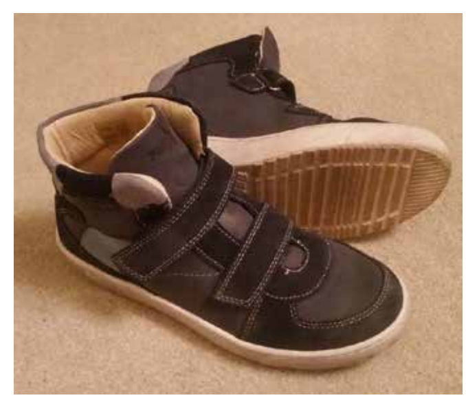
SCAMOSC/NABUK/NAVY/A - 51291/77