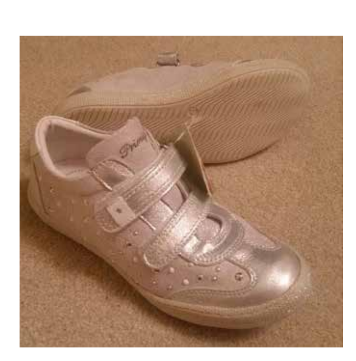
SCAM.BR/VIT.LAM/ARGE - 51690/7