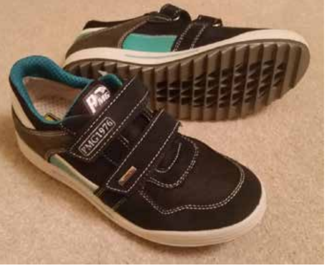
SCAMOS/T.TECNIC/NAVY - 56362/00