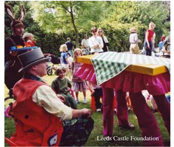
Leeds Castle Foundation

Lookout for the Caterpillar sitting on his shiny red mushroom although you will most likely hear him first, he does like to attract attention! Say hello to Tweedle Dum and Tweedle Dee , who will be wandering around being infuriating, ridiculous and