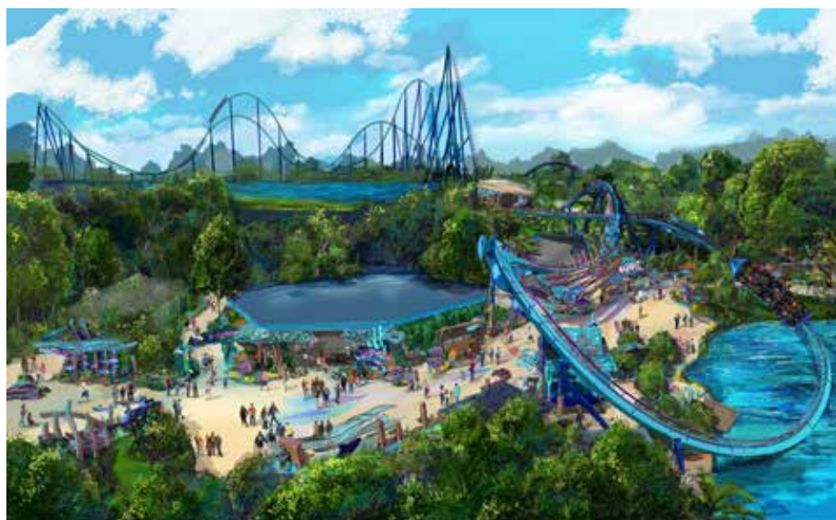
Concept Rendering

The Travel Trove offers your holiday packages and bespoke travel itineraries. All types of holidays corporate travel, groups, weddings and honeymoons. Customers are the cornerstone of the business and building trust and rapport is prerequisite in the delivery of that perfect journey. Excellent service every step of the way 020 3598 6245 www.thetraveltrove.co.uk