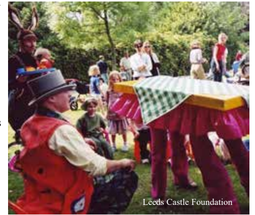
Leeds Castle Foundation

Hand in your completed trail card to receive a small chocolate prize. £1 per child applies. From the 25th until the 28th , there will be even more going on across the bank holiday weekend. Meet Alice and her friends as they pop up across the grounds during your day. At 11am each day, children can join in the hunt for the White Rabbit in the Woodland Walk . Lookout for the Caterpillar sitting on his shiny red mushroom although you will most likely hear him first, he does like to attract attention! Say hello to Tweedle Dum and Tweedle Dee , wandering around being infuriating, ridiculous and performing spontaneous tap dance routines. At 1.30pm daily in the Fairfax Courtyard , an interactive pop-up tea party will take place. Join the chaos with the Mad Hatter, March Hare, Alice and the Dormouse as