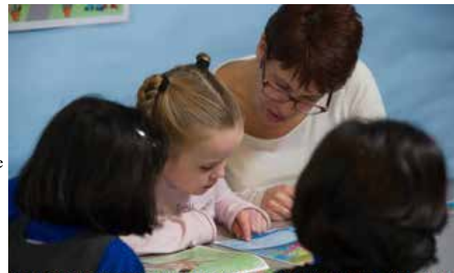
Cambridge Reading Adventures aims to instil a love for reading in learners at a young age.