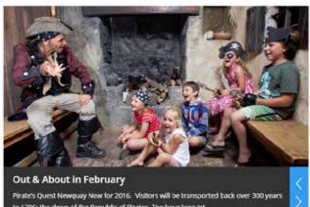
Out & About in February Pirate's Quest Newquay New for 2016. Visitors will be transported back over 300 years to 1766: the dawn of the Republic of Pirates. The hour-long pit

National News Parent Watch Travel Blog Write For Us