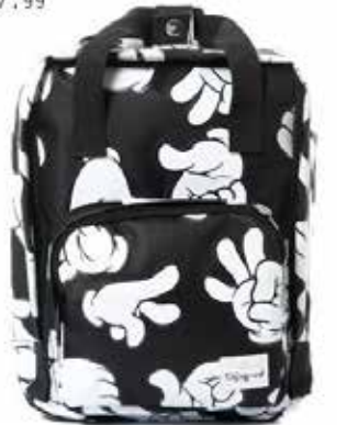
SIGNS LITTLE ASHBURY £17.99