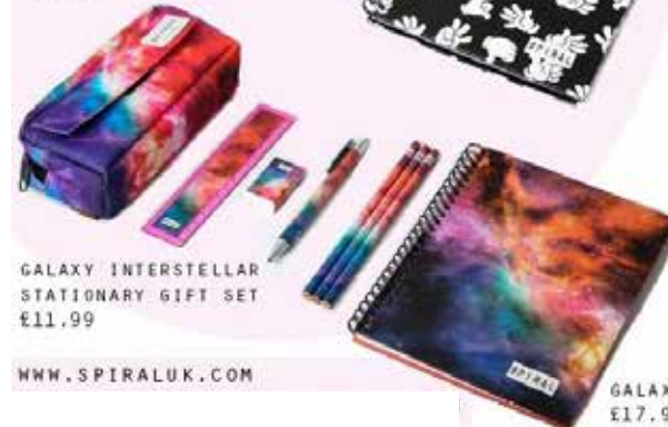
GALAXY INTERSTELLAR STATIONERY GIFT SET £11.99