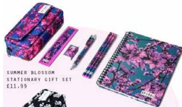
SUMMER BLOSSOM STATIONERY GIFT SET £11.99

WITH THE LATEST COLLECTION OF BRIGHT, BOLD AND FUN BACKPACKS AND STATIONERY SETS FROM SPIRAL, YOU'LL BE THE MOST FASHIONABLE KID IN CLASS.