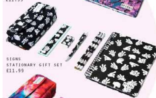
SIGNS STATIONERY GIFT SET £11.99